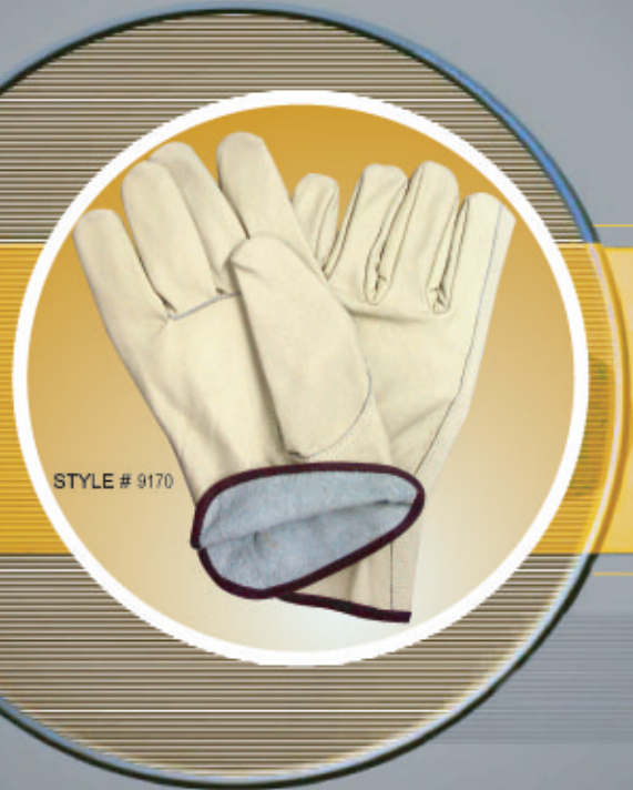
STYLE # 9170